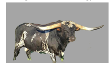
TOP HAND 146/1